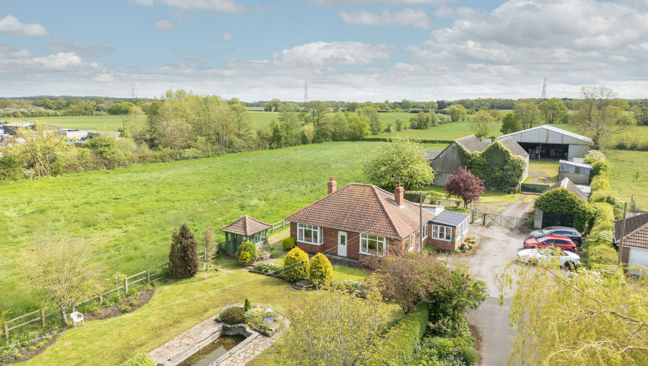
The Nursery, Hull Road | Dunnington, York